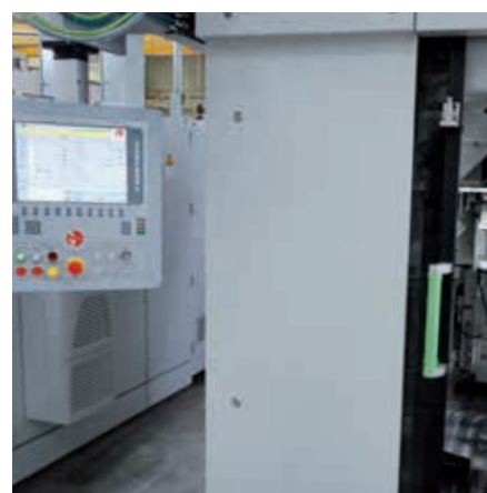
Moveable operator panel for a view of every station

Thanks to the moveable operator panel, you always have a view of every station. The user-friendly and clear graphic display of the Gehring Operator Panel (GOP) and the program assistant substantially simplify the machine operation. The electromechanical feeding system achieves the highest dimensional accuracy and shape correction. The spindles are optimally accessible via the direct maintenance area. Along with the attached maintenance panel, service friendliness is ensured.