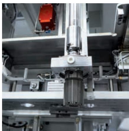
Air gaging PT-tool with digital measuring transformer for in-process gaging

A fast and efficient tool change system is an important requirement for flexible manufacturing. Process technology contingent tool changes and logistically necessary workpiece changes are performed reliably in a minimal amount of time. The machine-adapted tool system from the PT-series is used, utilizing its advantages. The pneumatic gaging system, consisting of the airgag tool and the Gehring digital measuring transformer, also works for large material removal with high accuracy.